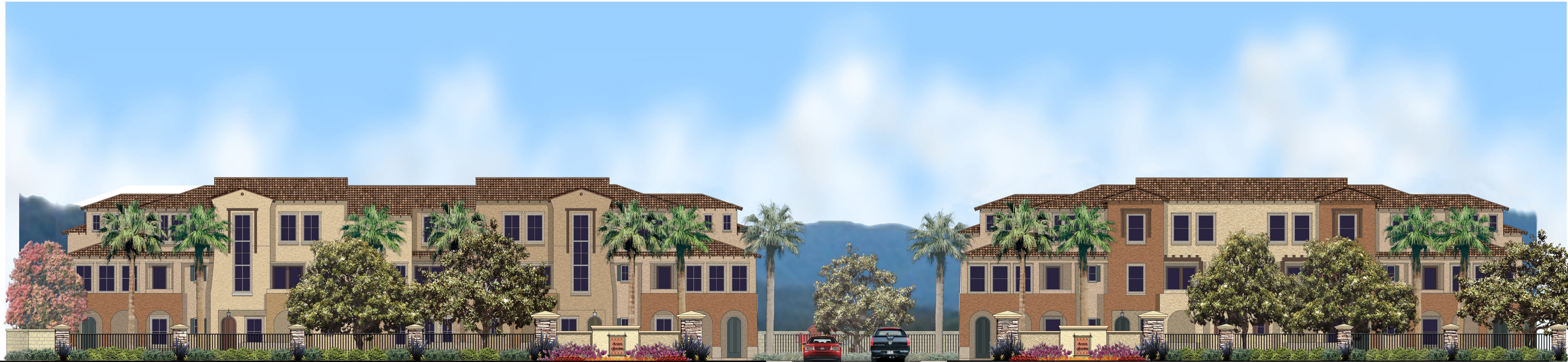
ACACIA AVENUE STREETSCAPE OVERALL ELEVATION NOT TO SCALE NOTE: PLANTING SHOWN AT 5 YEARS GROWTH