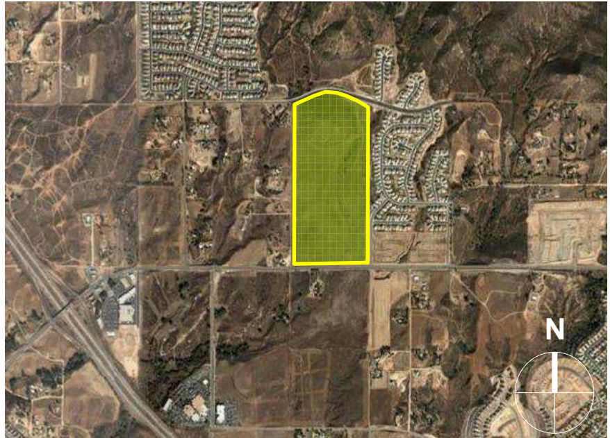
Wildomar Campus 77 Acres