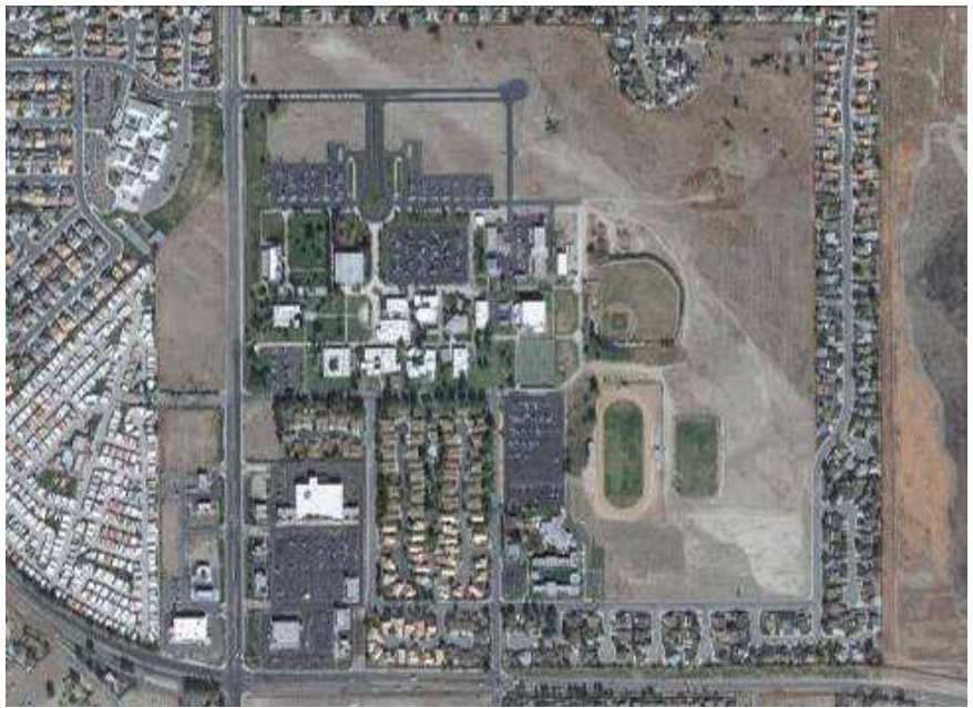
Mt. San Jacinto Campus 152 Acres