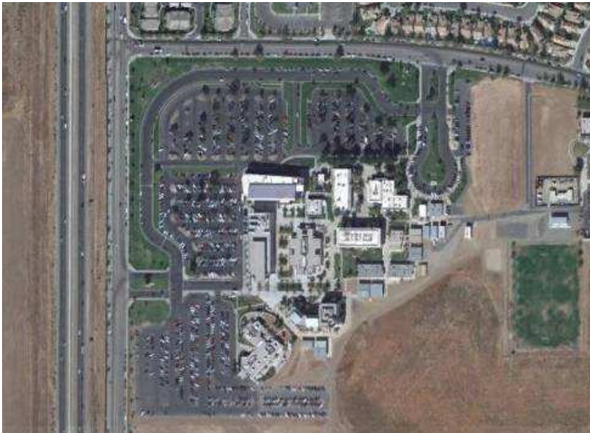
Menifee Valley Campus 100 Acres