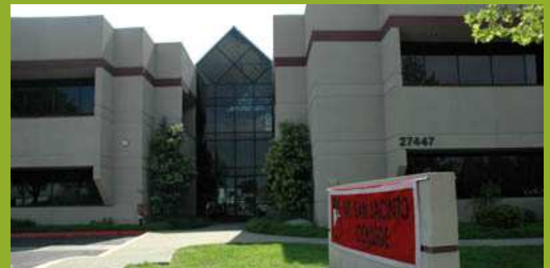
Temecula Education Complex