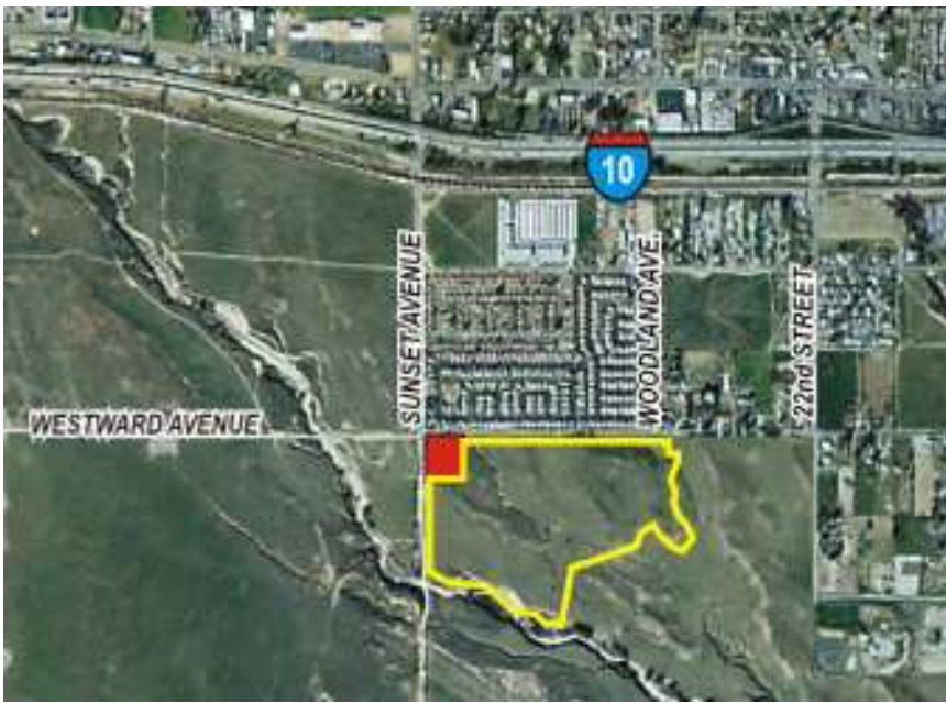
San Geronio Pass Campus 50 Acres