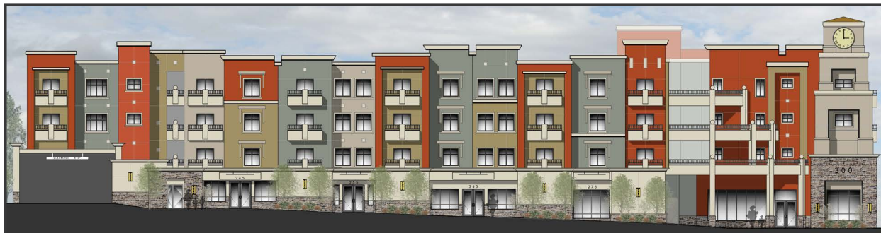
W. 3rd Avenue Elevation