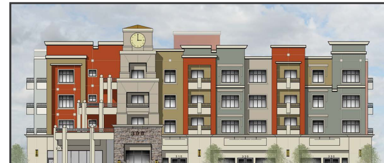
S. Escondido Boulevard Elevation