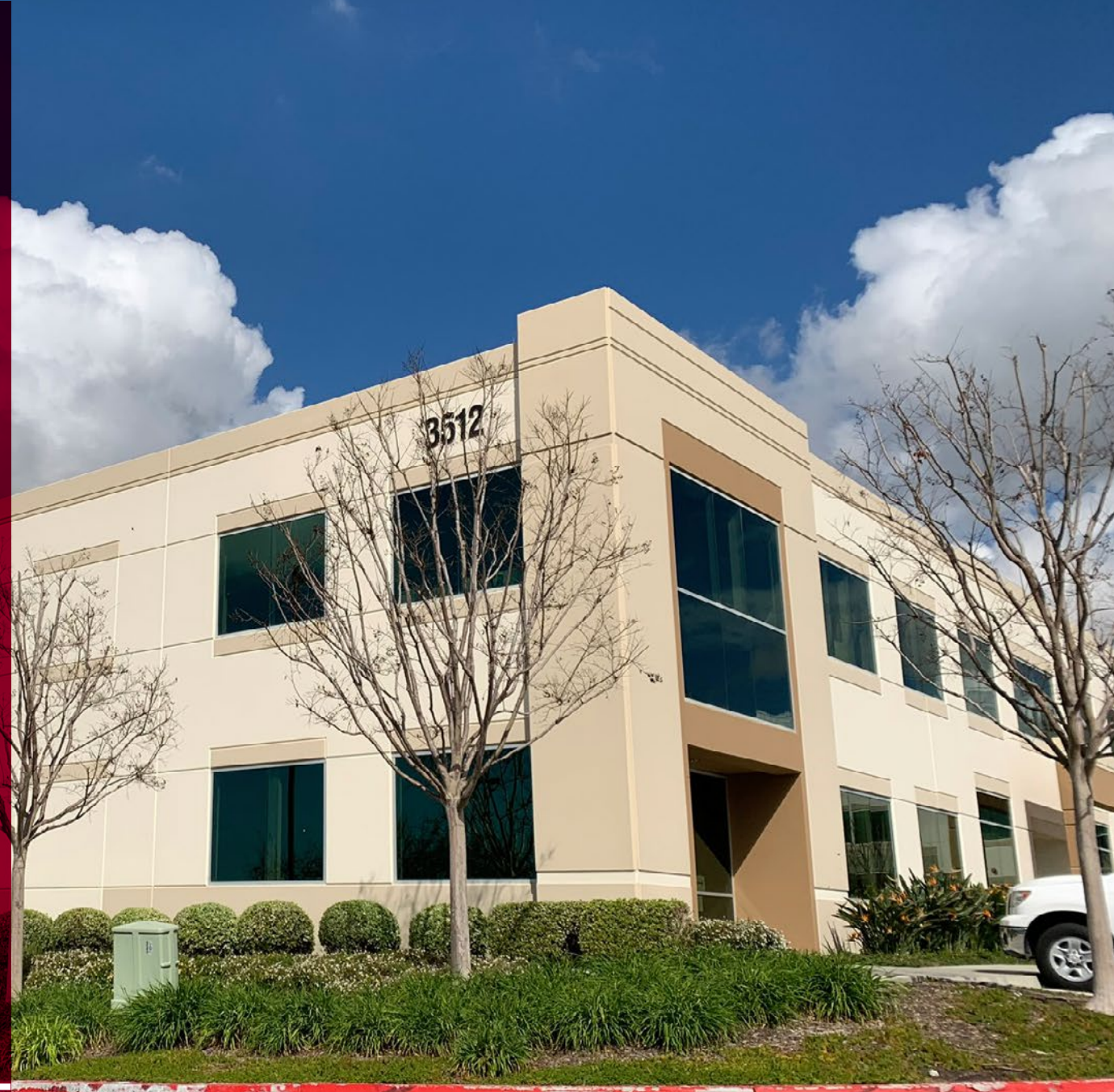
Featured Image: 2,405 SF Industrial Condo In Oceanside.