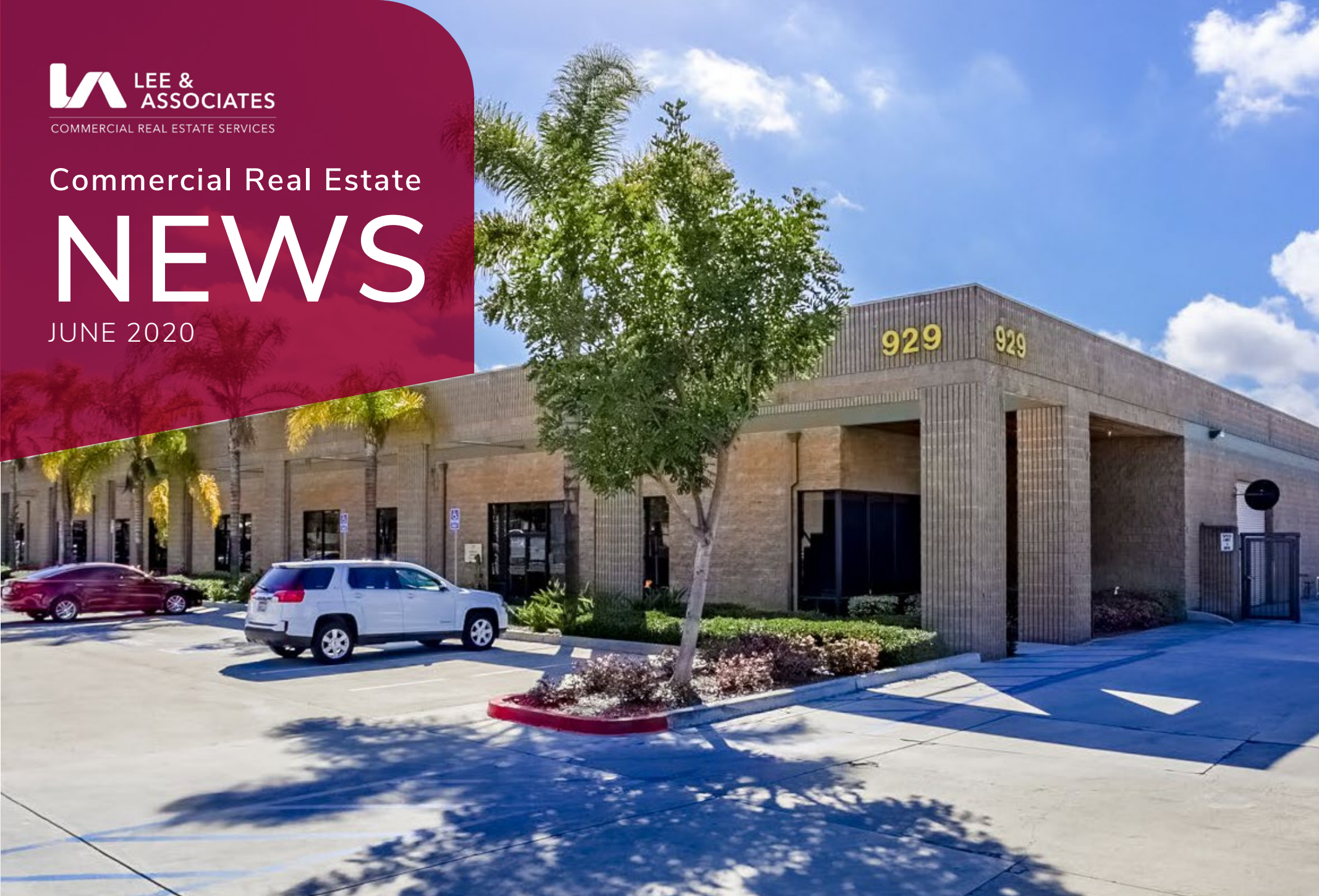
Featured Image: ± 8,286 SF - 24,035 SF Industrial Condominiums for sale in Vista