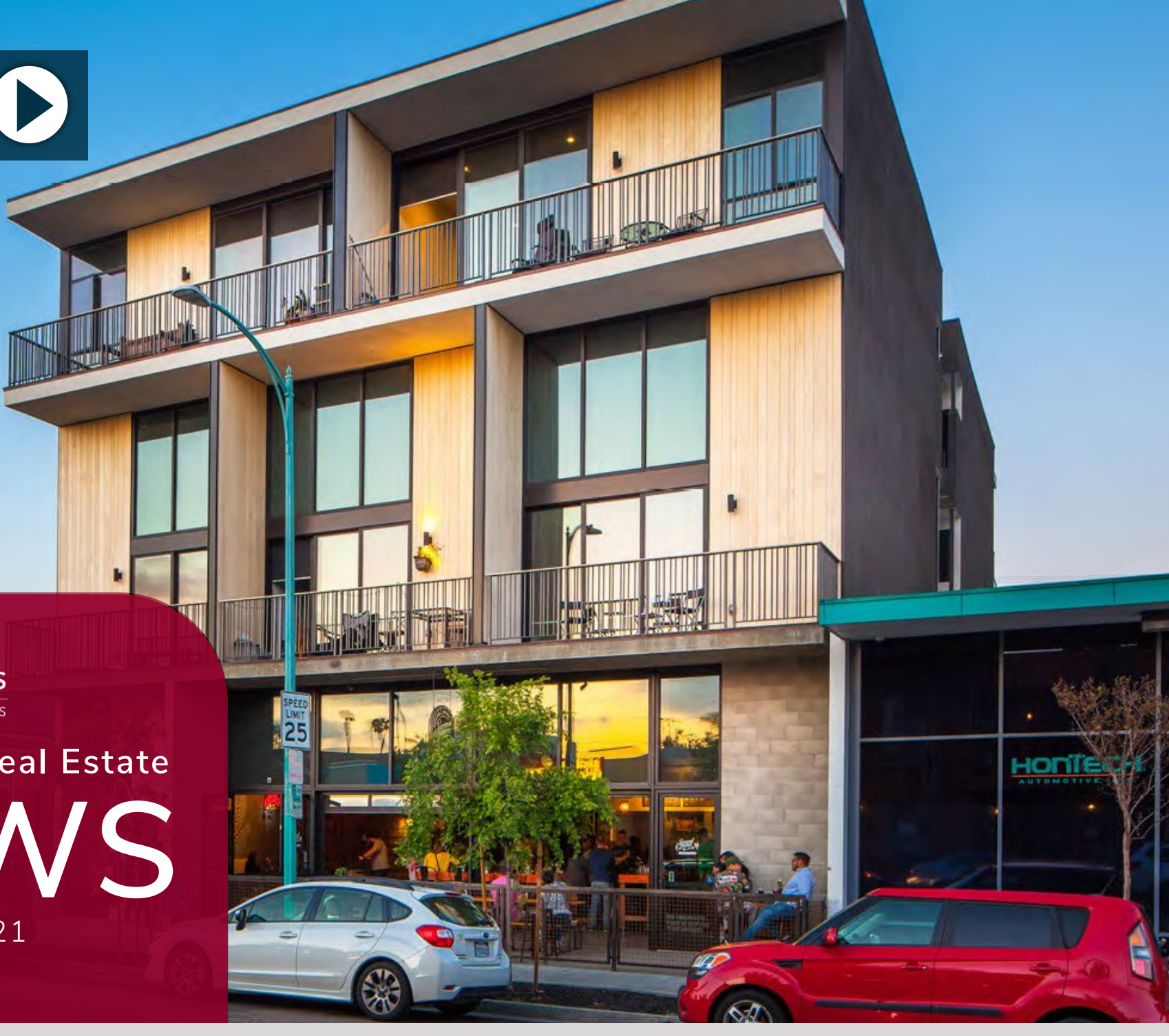
Featured Image: For Sale | a 3-story building built in 2017 featuring 10 Apartment homes & 1,820 sf commercial space | NORTH PARK