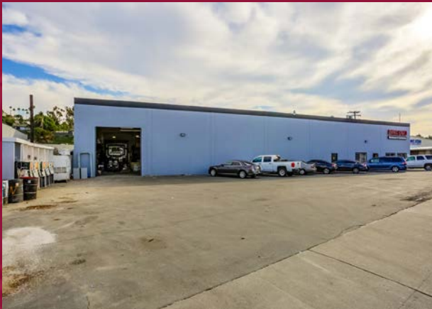
Frontage Along Industry Street with Ample Parking