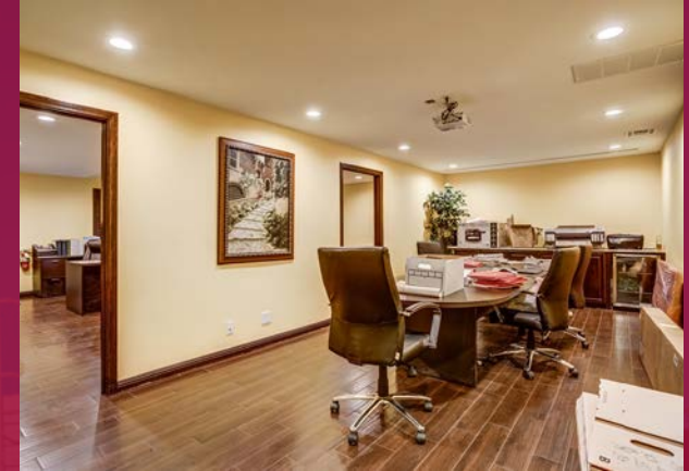
Conference Room with Drop Down Projector