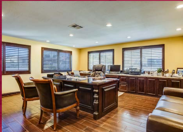
Custom Built Cabinets and Granite Countertops in Executive Office