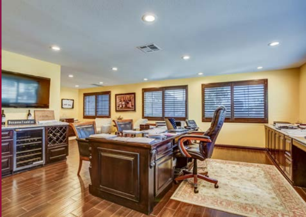
Executive Office with Private Restroom