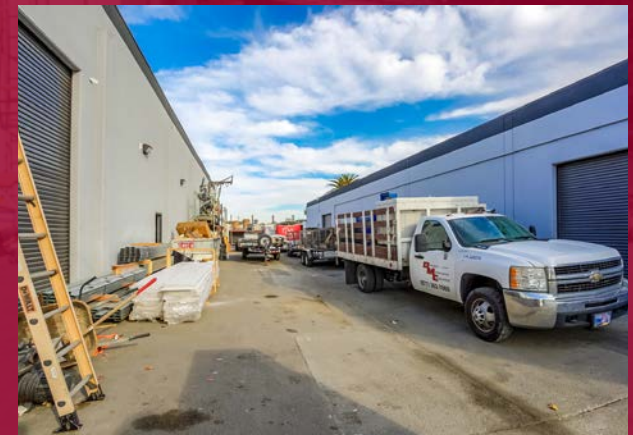
Fenced Yard Area Between Buildings