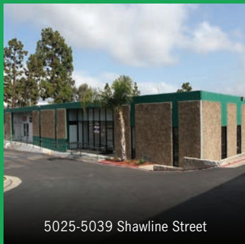
5025-5039 Shawline Street