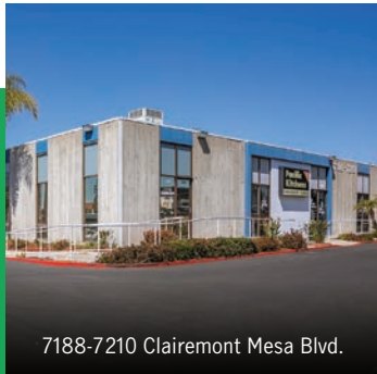
7188-7210 Clairemont Mesa Blvd.