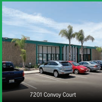
7201 Convoy Court