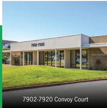
7902-7920 Convoy Court