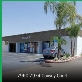
7960-7974 Convoy Court