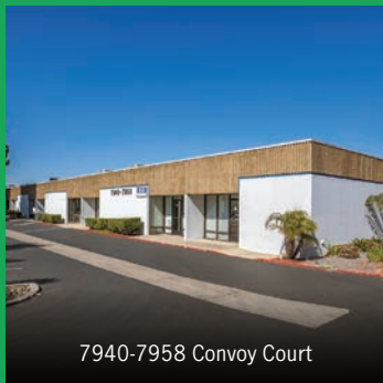
7940-7958 Convoy Court