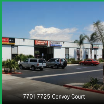
7701-7725 Convoy Court