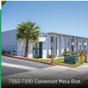
7560-7590 Clairemont Mesa Blvd.