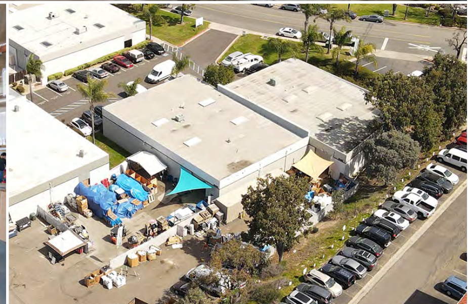
LARGE WAREHOUSE SPACE | ROLL-UP DOORS | 14' CEILINGS | UPDATED RECEPTION | PRIVATE OFFICES