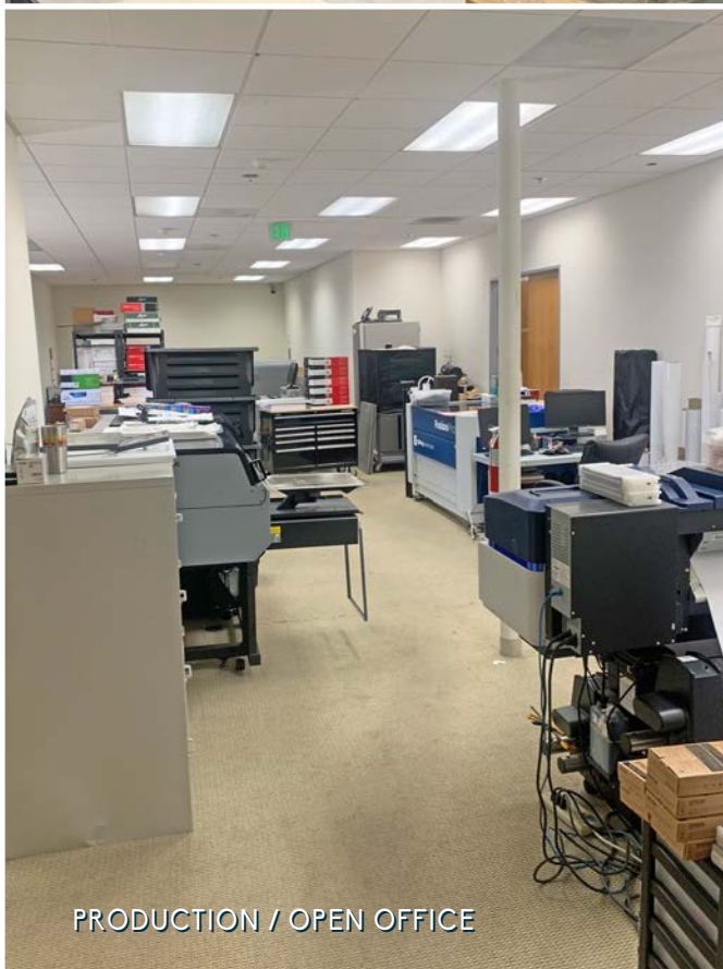
PRODUCTION / OPEN OFFICE