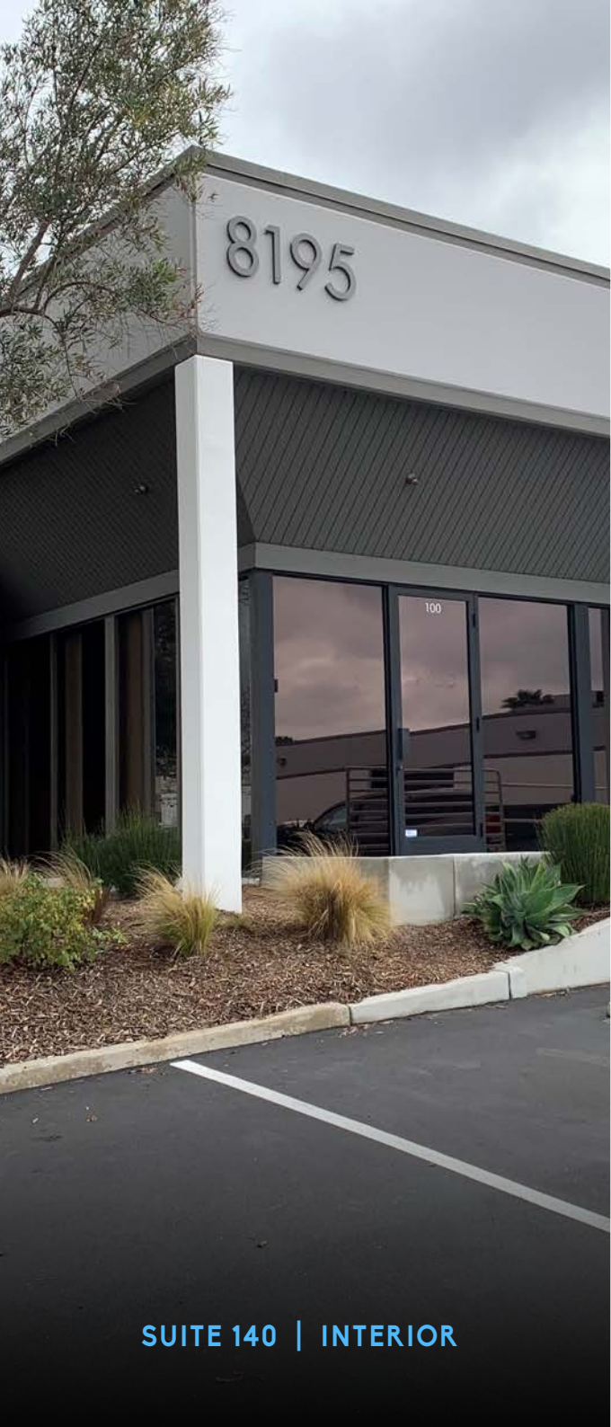
SUITE 140 | INTERIOR