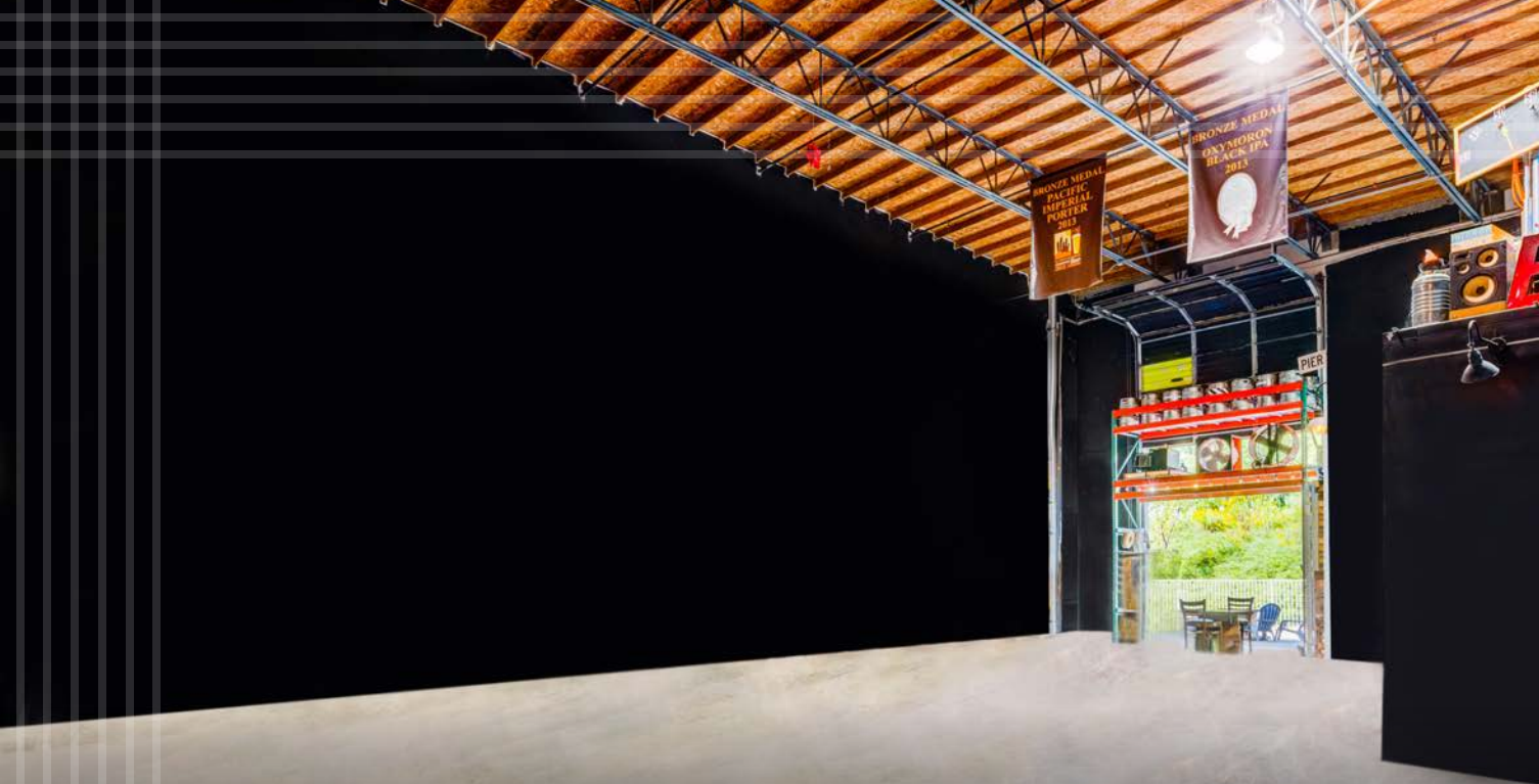
CONCEPTUAL RENDERING WITH WAREHOUSE DELIVERED VACANT