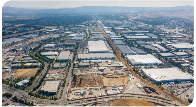
The Tri-Valley area includes the cities of Livermore, Dublin, and Pleasanton