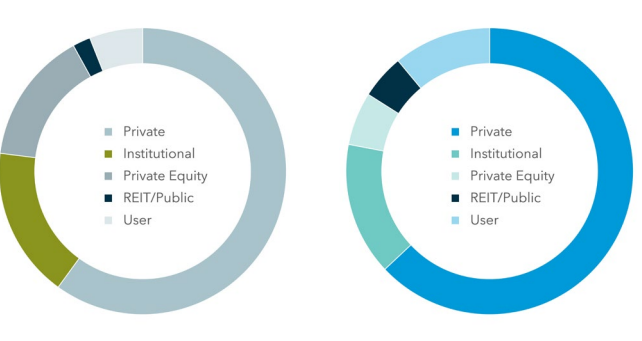
**'Sale by Buyer' and 'Sale by Seller' Data is comprised of data from the previous 12 months.