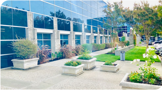
The Tri-Valley area includes the cities of Livermore, Dublin, and Pleasanton